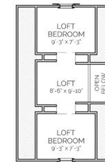
LOFT FLOOR PLAN